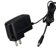
Power Supply Unit